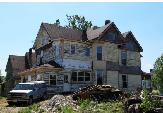
Rehabilitation activity in Muncie’s Emily Kimbrough National Register Historic District.

neighborhoods from the city, county, state, and census. We spent nearly a week in Muncie to meet with local officials and gather field data such as buildings’ architectural character and up-to-date occupancy status.