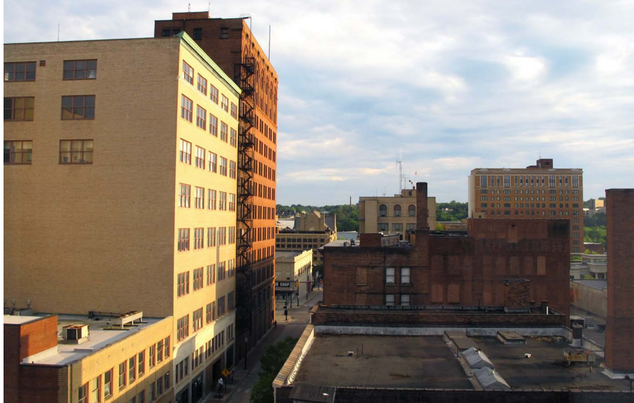
View of downtown Youngstown from the Erie Terminal Place, a historic train station rehabilitated in 2012 as apartments.