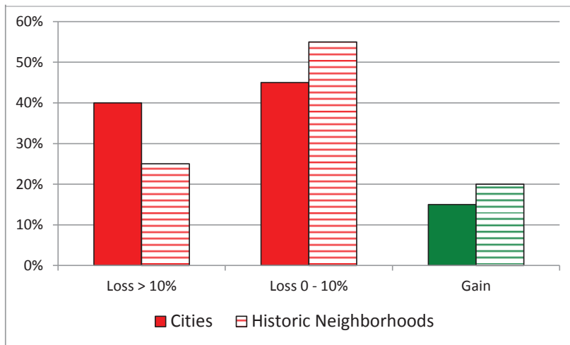
Figure 3 Severity of Population Change: Cities vs. Historic Neighborhoods

A final way of looking at the difference between what is happening in historic neighborhoods and in the study cities overall is to look at the severity of the population change. More cities than historic districts suffered population losses of greater than 10%. On the other end of the spectrum, historic districts in more cities gained population than cities overall (Figure 3).